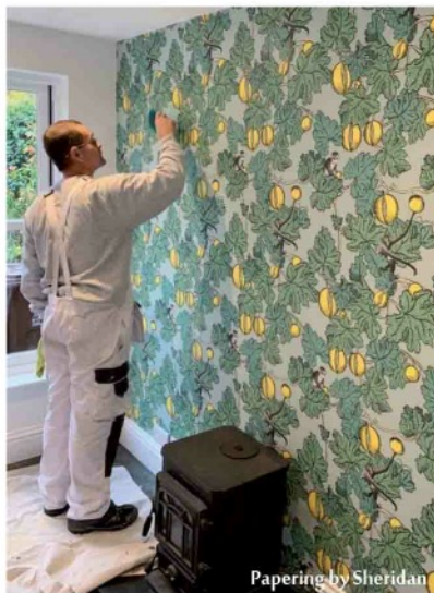
Papering by Sheridan