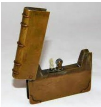
Early 20thC Lighter