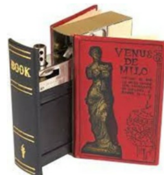
Mid 20thC Lighter