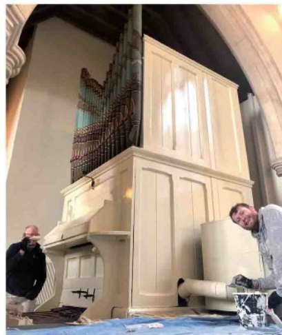
Specialist skills are often required when decorating ancient churches

"We all get immense satisfaction from doing a job really well and I still get a buzz from the