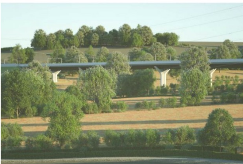
Artist's Impression - Masked View

When viewed from a distance, against the weathered steel, the pale concrete parapet will appear as a thin horizontal band hovering over the slender piers as it glides over the valley and make the whole structure look thinner. This effect will be further emphasised by the viaduct piers, which have been extended to almost connect with the parapet, helping to give the appearance of a light and narrow structure.