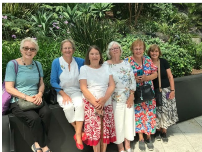
The Chiltern Ladies London Group in the Sky Garden.

It was truly spectacular, and best of all - free of charge. We enjoyed an excellent, healthy, late lunch at the Natural Kitchen.