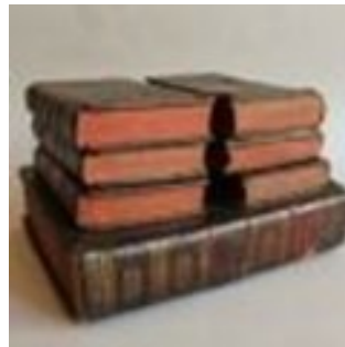
18thC Liquor Casket would have held decanters