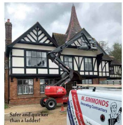
Safer and quicker than a ladder!

which I did for two years as a trainee painter and decorator. I remember it well - I was put straight 'on the brush' - my first job being to paint some old timbers with creosote, yuk! I got covered in the stuff and stunk of it for days after! It was an interesting job though, because most of the work we did was in old buildings in and around Haddenham. It's where I learnt about working with lime plaster and old witchert, a skill that has been with me ever since. I've been able to pass on these traditional skills over the years, and they have stood us in good stead, as we are still known locally for having the specialist skills, knowledge and capabilities to work on a vast variety of old properties, including churches and historic buildings.