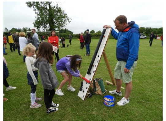
Jubilee Photographs on this page kindly provided by Janette West