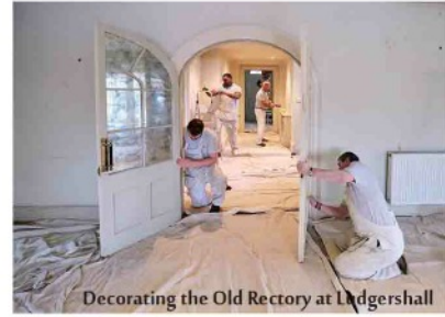
Decorating the Old Rectory at Ludgershall