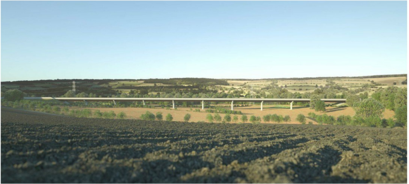
Artist's impression - Wendover Dean Viaduct

The 450m viaduct was recently given approval by Buckinghamshire Council under Schedule 17 of the HS2 Act. Dark weathered steel beams will support the 450m Wendover Dean Viaduct echoing the colour of the surrounding countryside while an innovative 'double composite' structure will halve the amount of embedded carbon in the structure.